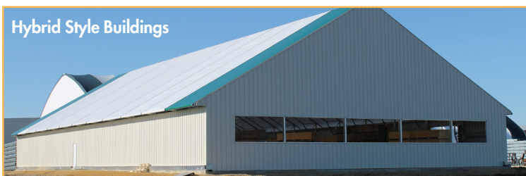
Hybrid Style Buildings