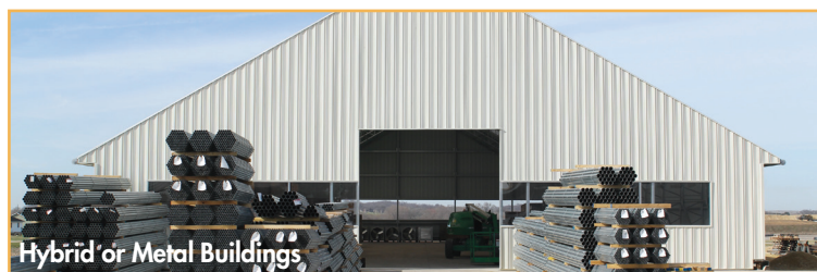
Hybrid or Metal Buildings