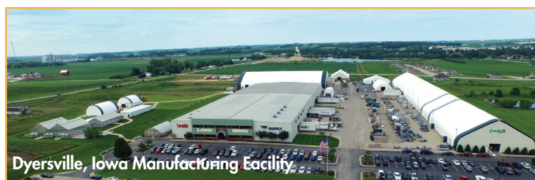
Dyersville, Iowa Manufacturing Facility

Since 1979, ClearSpan has offered cost-effective, versatile and energy-efficient building solutions . We provide in-house design, manufacturing and construction, and pride ourselves on offering superior customer service . Our experienced truss arch specialists are highly trained to help you determine the best structure and setup for your needs. With stock, turnkey and design-build solutions, there is a ClearSpan fabric structure for everybody.