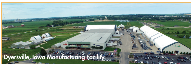
Dyersville, Iowa Manufacturing Facility

Since 1979, ClearSpan has offered cost-effective, versatile and energy-efficient building solutions . We provide in-house design, manufacturing and construction, and pride ourselves on offering superior customer service . Our experienced truss arch specialists are highly trained to help you determine the best structure and setup for your needs. With stock, turnkey and design-build solutions, there is a ClearSpan fabric structure for everybody.