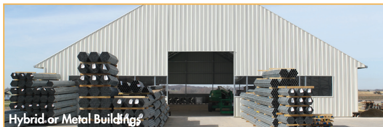
Hybrid or Metal Buildings