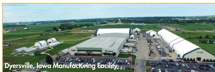
Dyersville, Iowa Manufacturing Facility

Since 1979, ClearSpan has offered cost-effective, versatile and energy-efficient building solutions . We provide in-house design, manufacturing and construction, and pride ourselves on offering superior customer service . Our experienced truss arch specialists are highly trained to help you determine the best structure and setup for your needs. With stock, turnkey and design-build solutions, there is a ClearSpan structure for everybody.