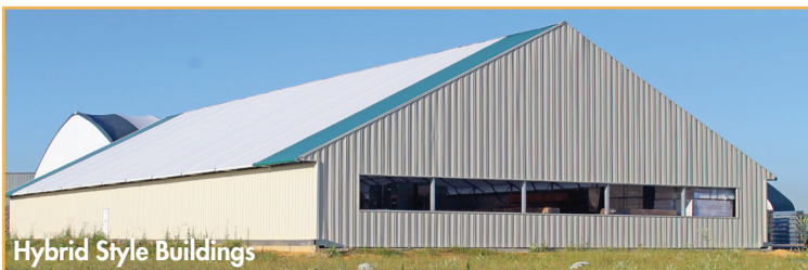
Hybrid Style Buildings